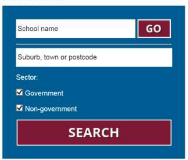
Find a school

Where it states 'School name', type in the name of the school you wish to view, select the school from the drop-down list and select <GO>. Read and follow the instructions on the next screen; you will be asked to confirm that you are not a robot then by clicking continue, you acknowledge that you have read, accepted and agree to the Terms of Use and Privacy Policy before being given access to the school's profile webpage.